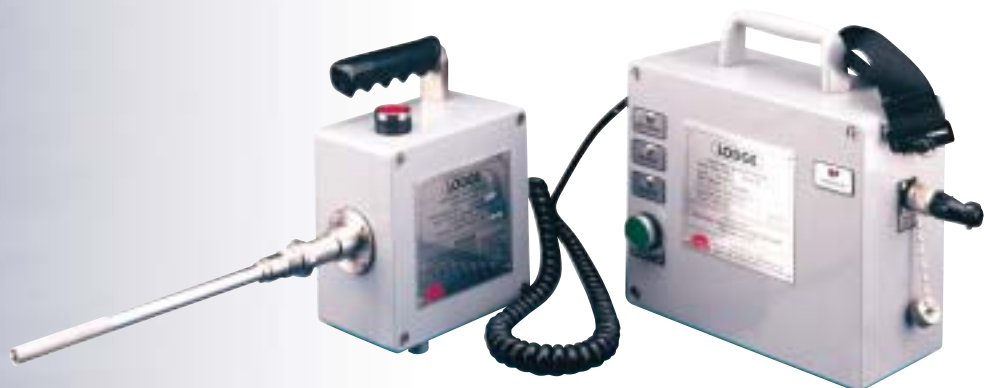
Portable high energy ignition system