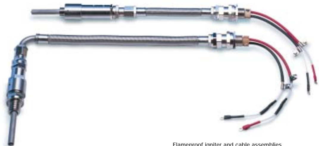
Flameproof igniter and cable assemblies

As with high energy systems, Vibro-Meter UK can provide a range of high tension systems, using various input voltages, with a 10,000 volt output connected via a sealed screened cable system to a flameproof igniter head. The igniter head used depends on the application and customers' requirements. Vibro-Meter UK has also custom-built a wide variety of systems to suit a variety of applications including those where the high power high tension system – rather than a conventional 10,000 volt transformer – is required.