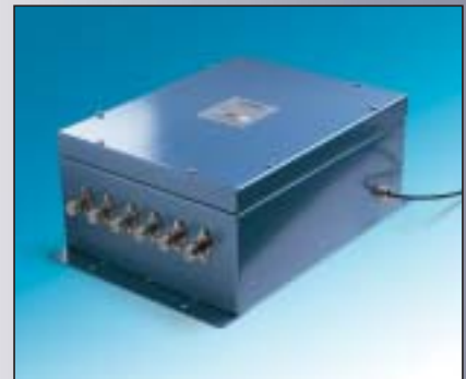
Multiple output solid state high energy ignition unit