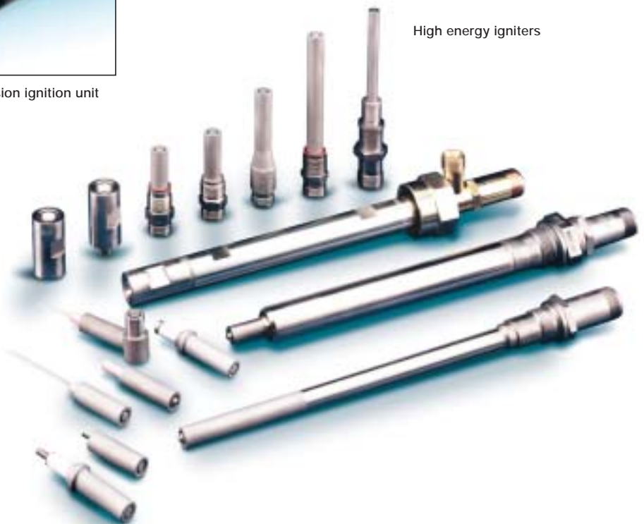
High energy igniters

Quality goes beyond the supply of reliable products and covers all our activities, including the control and monitoring of manufacturing and sales procedures. Vibro-Meter UK has a fully-equipped, specialist quality control and inspection department. As well as quality approvals from major organisations, Vibro-Meter UK operates in accordance with ISO9001 (certificate number 12144) and all flameproof equipment is approved by the relevant certifying authority.