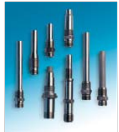
High energy igniters