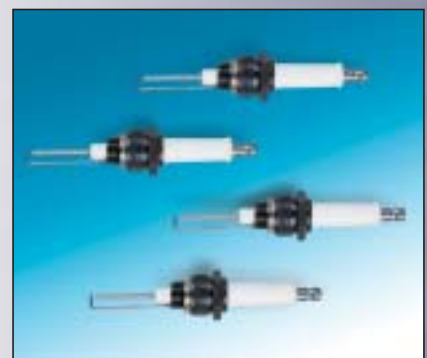
High tension igniters