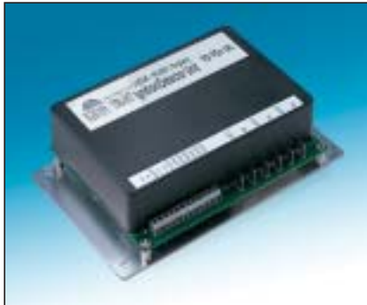
Multiple output high tension ignition unit

Vibro-Meter UK's capabilities cross a wide and diverse range of ignition applications: from small gas burners, through flarestacks and large power burners, to microturbines and highly specialised flameproof systems for industrial turbines. The product range includes sophisticated equipment for use in hazardous environments, atmospheres and extremes of temperature and climate.