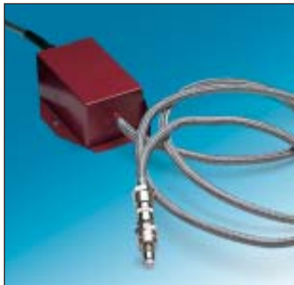
High power high tension ignition system

The high power high tension unit generates up to 18,000 volts in almost continuous discharge and can operate in applications where conventional high tension systems are ineffective. Options include integral flame detection via the ignition electrode. All systems comply with the relevant EMC directives.