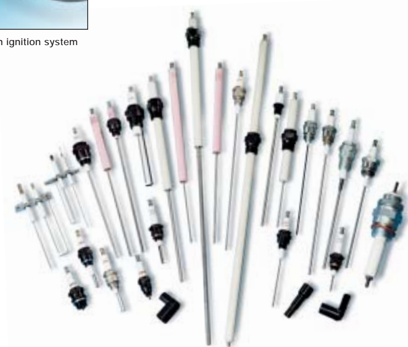
High tension ignition electrodes and caps

The Vibro-Meter UK HTI/18 is the most portable high tension system and runs off four AA cells. Its combined unit and igniter construction provides operators with a simple and reliable source of high tension ignition and is available 24 hours a day.