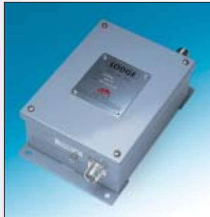
High energy ignition unit

Vibro-Meter UK's world class, proven portable high energy ignition system is powered from a rechargeable battery pack. Extensively used as a standby system, it can also be used to ignite a number of burners where the installation of a separate, permanent igniter on each boiler would be uneconomical.