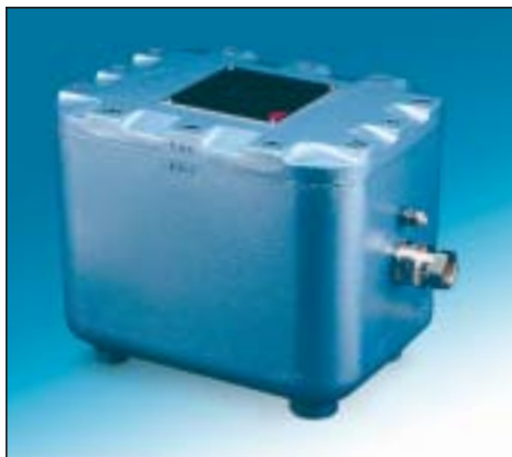
Flameproof ignition unit

Vibro-Meter UK supplies high energy and high tension systems and has provided custom-designed systems for a variety of hazardous applications using proven technology and certified enclosures.