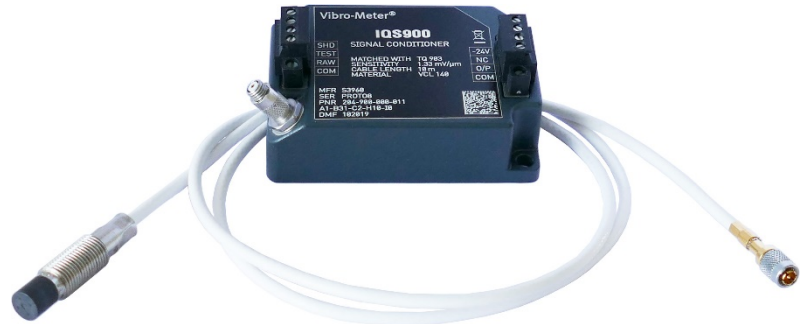
TQ902 proximity sensor with integral cable and IQS900 signal conditioner